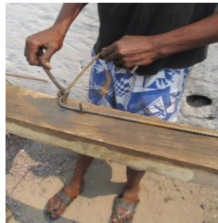
How is this for hand-molding rebar!

They also were able to purchase a real saw for the lumber: a great improvement on this 12-inch one.