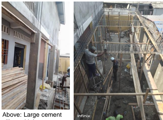
Above: Large cement pillars with heavy steel bars inside are built in the courtyard. Right: Then similar steel & concrete structures are being extended across the courtyard to hold up the 2 nd floor.

The 2-story Center was built with an open courtyard on one side, for outdoor activity & a car park (everything must be inside the high concrete security fence & heavy yellow metal door, visible at the top of the photos). Severe rains flooded the court, so it was covered, to create an assembly area. Now this courtyard is being incorporated into the building, to provide 3 more classrooms on the 2 nd floor & a more formal assembly space on the 1 st floor.