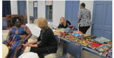
Visiting Haddonfield Meeting