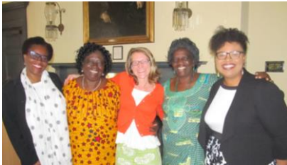
Visiting Princeton Theological Seminary