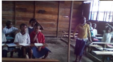
Hundreds of destitute children now attend school for the first time